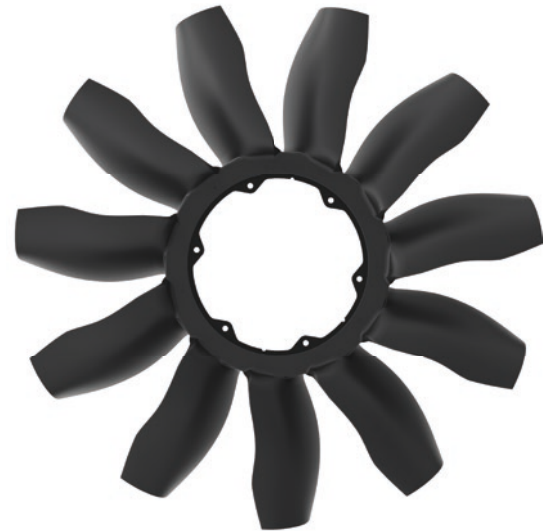
The Horton HS11A has been designed to provide the airflow and pressure needed for new cooling system requirements in high-performance heavy-duty trucks