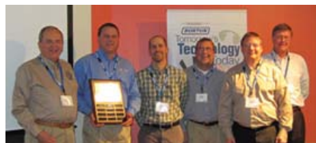
Horton, Inc. — Pusateri Award

Horton, Inc. presented Pusateri Sales of Canton, Ohio, with the